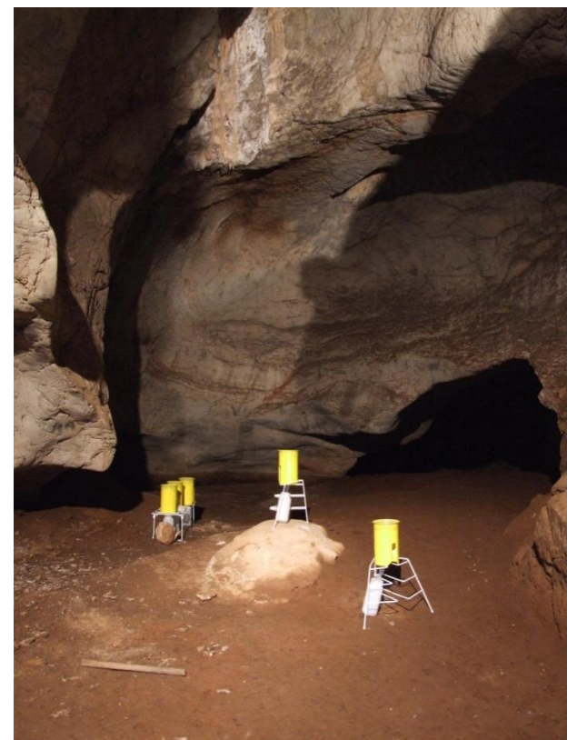
Figure 3: Cave drip water monitoring. Data loggers sit in the yellow tubes and water is collected in bottles underneath.

The data from figure 2 is obtained from state-of-the-art loggers that automatically measure the water flow rates of drip waters that emerge in the cave. Systems are also in place to collect these drip waters for chemical analyses as shown in figure 3. This will allow researchers to quantify the variability of the flow and relate it to properties of the aquifer such as depth below surface, geological structure and the fracturing of the bedrock. This research is vital to better understand water resources in limestone regions of SE Australia.